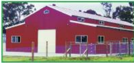
OLD AMERICAN BARN

These make great farm sheds or maybe a horse stable. You can add a mezzanine floor for storage upstairs.