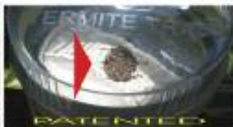
The "we've arrived" mud signal easily visible through the clear top cap.

Money back if they're not as you expected