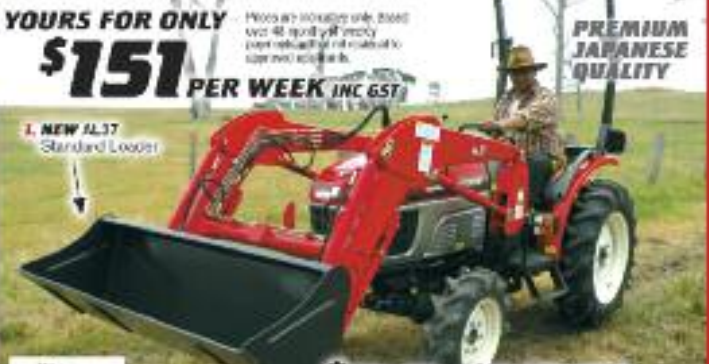
1. NEW 4L37 Standard Loader