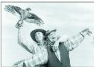
"Your new Hawk Bird Scarer replaces the old Customized Scare-Crow"

Order now & you will receive a Free 28 Page Booklet.