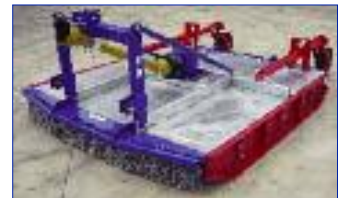
6' & 7' galvanised contractor slashers with unlimited HP gearboxes.