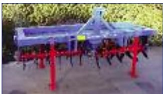
Grow-Master Aerator designed to shatter the compact soil, increasing water and air absorption which in turn encourages pasture growth.