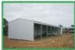
"8 BAY BEAUTY!"

Including one Lock Up Bay with a Slider door This is Great Value! 7.5m x 32m x 3.6m $16,940