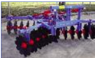
TH30 Linkage tandem disc plough. Available in 16, 20 and 24 plate.