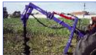
Planetary drive posthole diggers with hydraulic down pressure, various auger sizes.