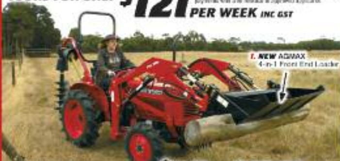
1. NEW AGMAX 4-in-1 Front End Loader

Visit our website www.sotatractors.com for more info!