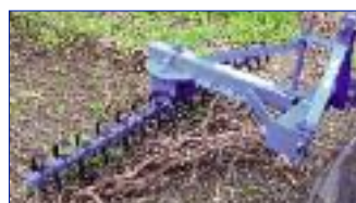
Designed for raking sticks, small rocks & trash. Various sizes to suit all tractors.