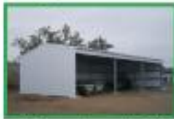
"9.0m x 18m x 4.0m"

Including one Lock Up Bay with a Slider door This is Great Value! 7.5m x 32m x 3.6m $16,940