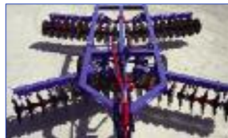
New model folding tandem disc plough. Available in 28, 32, 36, 40, 44 & 48 plate.