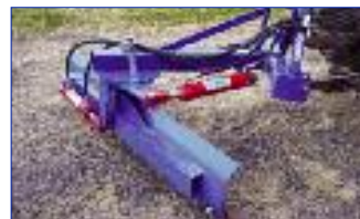
6' medium heavy duty hydraulic grader blade. Hydraulic angle and tilt plus manual offset.