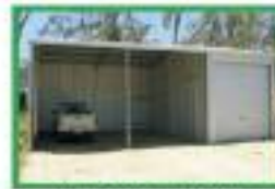
"LITTLE LOCK UP"

9.0m x 24m x 4.8m 4 Bay Shed with Lock Up Bay, P.A. Door, 2 Windows and a Bonus Skylight From $19,900