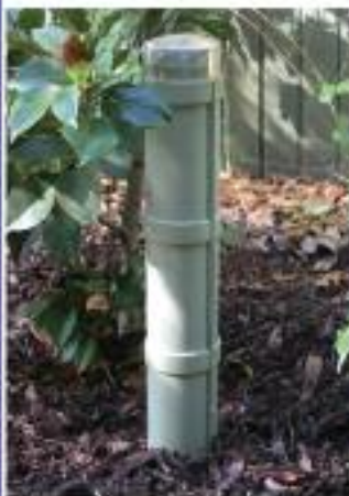
A termite trap hard at work