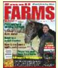
Our September 2009 issue features 'Preparing your farm for a horse'.

To order your Small FARMS magazine subscription and a chance to win this great prize telephone (02) 4861 7778, or subscribe on-line at www.smallfarms.net . Subscriptions start from only $36.00